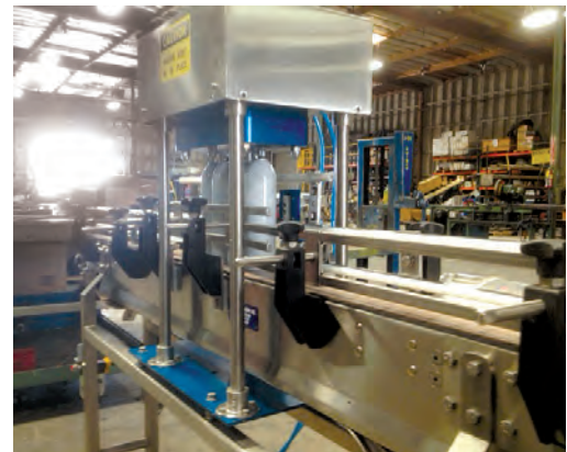
4-Head Inline Production Crimper

Gerstung Aerosol 8648 Jesolo Court Las Vegas, NV 89131 www.gerstungaerosol.com Tel:760-780-9870