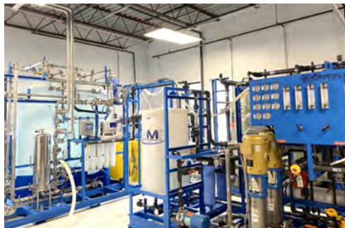
Tri-Pac UPW RO-EDI USP Water System