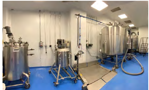
Tri-Pac PBR1 – Compounding Suite 1