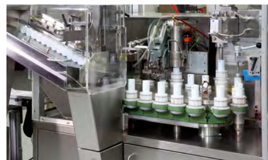
Tri-Pac Line 8 – Tube Filling Line

Tri-Pac, Inc. 3333 N. Kenmore St. South Bend, IN 46628 Tel (574) 855 2197 Fax (574) 387 4704 sales@tri-pac.us www.tri-pac.us