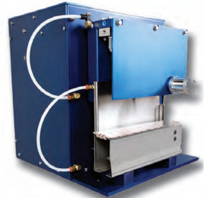
6-Head Production Gasser/Shaker