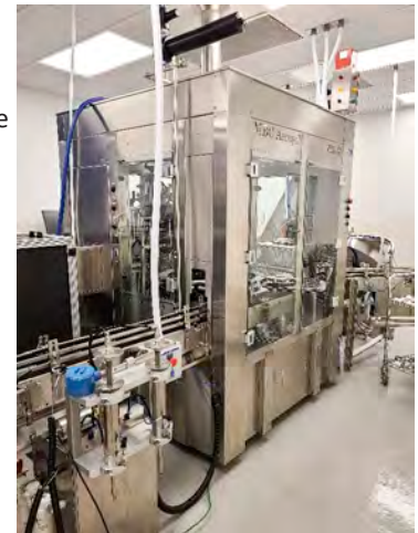
Tri-Pac Line 7 – Foam & Spray Aerosol Filling